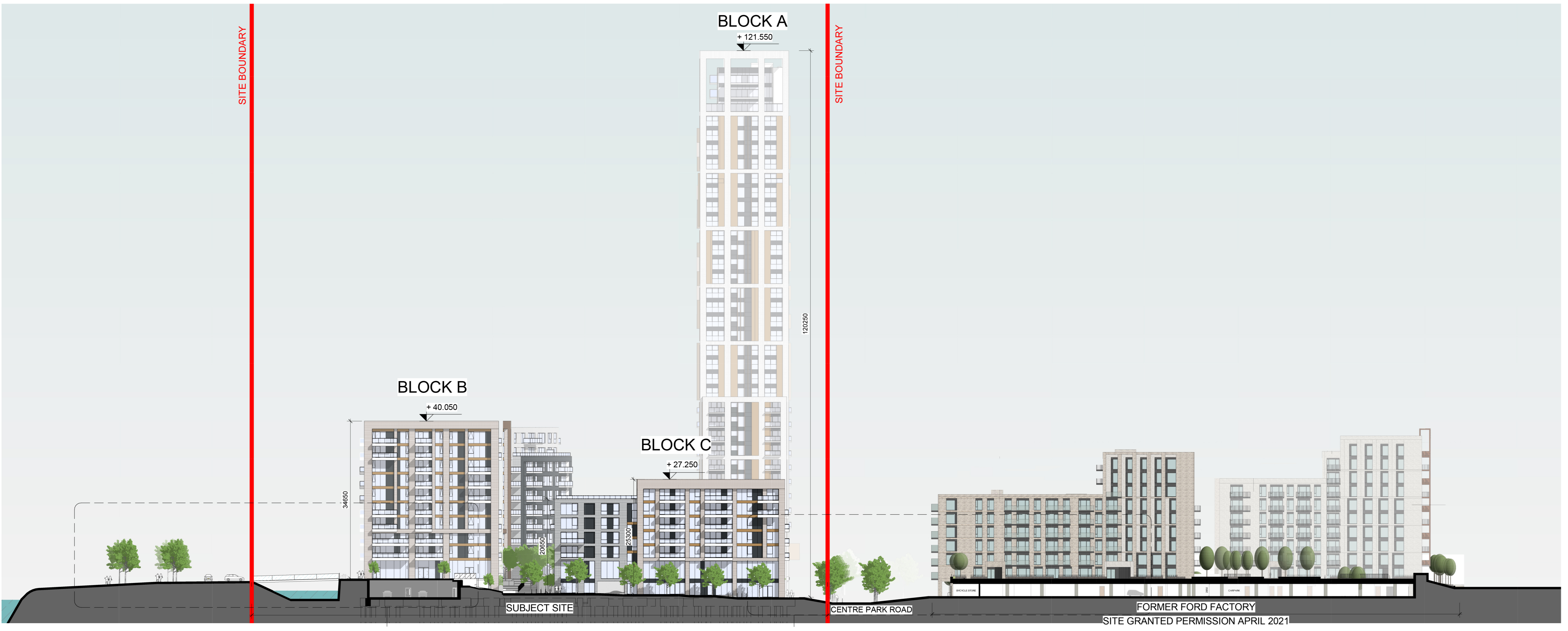
1 PROPOSED CONTEXTUAL SITE SECTION H-H 1:500

NOTE: FOR CLARITY PURPOSE, TREES ALONG MARINA PARK AND CENTRE PARK ROAD ARE NOT BEING SHOWN