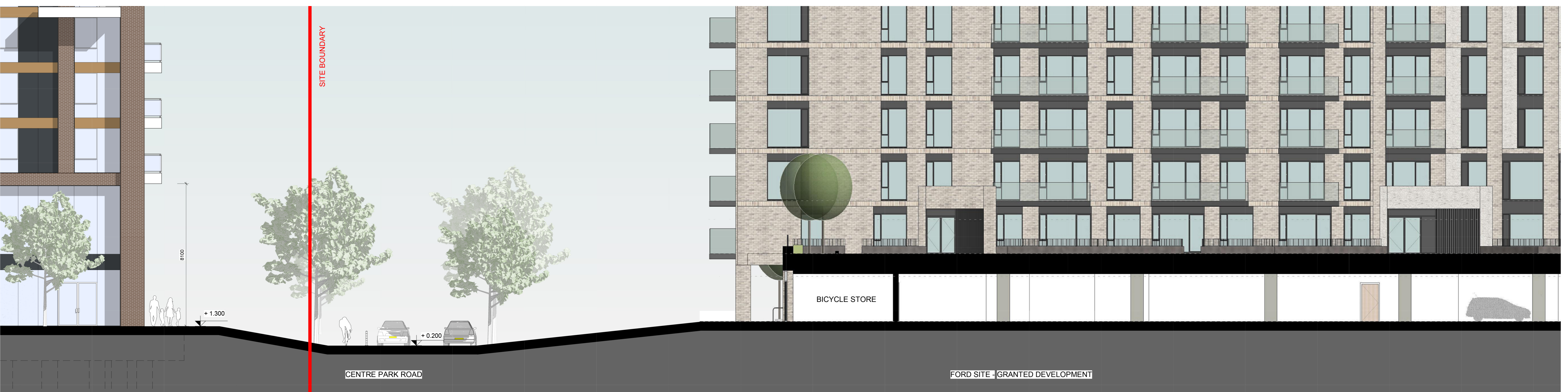
3 CONTEXTUAL SITE SECTION H-H - DETAIL 1:100